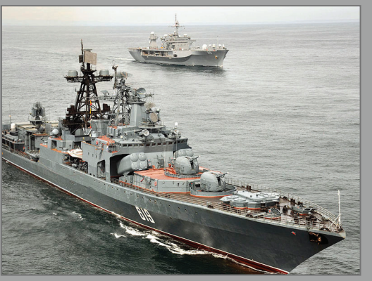
SEVEROMORSK, UDALOY CLASS DESTROYER, SEPTEMBER 2011.