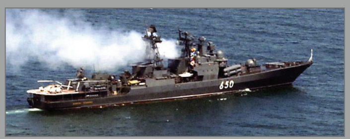
ADMIRAL CHABANENKO, UDALOY CLASS DESTROYER, JANUARY 2012.