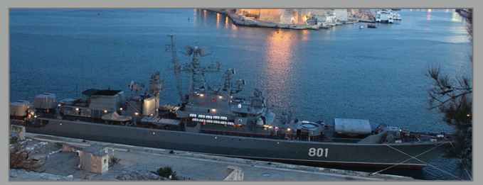
LADNY, KRIVAK CLASS FRIGATE, JANUARY 2012.