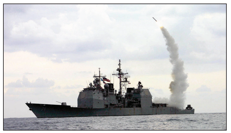
PHOTO 3 | TLAM LAUNCHES FROM THE GUIDED MISSILE CRUISER USS CAPE ST. GEORGE (CG 71)

TLAM is an extremely capable weapon as long as it is used against appropriate targets. It is very capable against "soft targets" such as radars, communication relays, antennae, commercial grade buildings, aircraft, and vehicles. When used against a soft target a TLAM will achieve what is known as a "hard kill," or complete physical destruction of the target. When used against moderately armored targets, such as a reinforced concrete and asphalt runway, TLAM will cause enough damage to achieve a "mission kill" by rendering the runway unusable for a period of time, but not totally destroying it. <sup>29</sup> If used against a heavily defended target, such as a command bunker buried deep underground, the TLAM will have no effect. TLAM is a very capable weapon, but it must be used against appropriate targets for its capabilities.