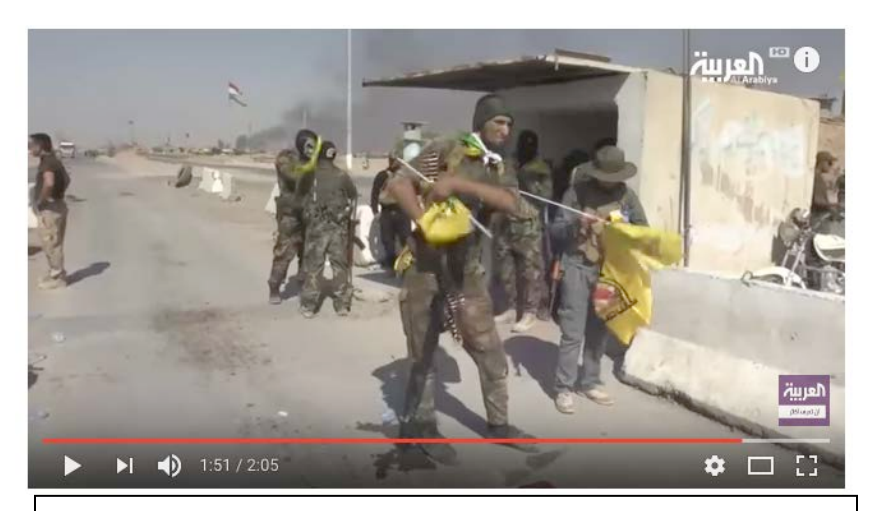
Al Arabiya video on October 16, 2017 shows Katai'b Hezbollah fighters near Kirkuk.

Al Arabiya published a <u>video</u> on October 16 from a location near Kirkuk City showing two trucks laden with fighters carrying KH flags, in addition to fighters carrying KH flags stationed at a checkpoint.