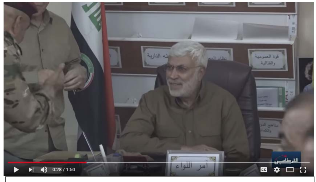
Abu Mehdi al Muhandis arrives close to southern Kirkuk and sits in an apparent Badr Organization office on September 18, 2017.