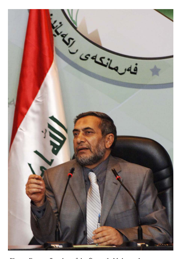
Photo: Former Speaker of the Council, Mahmoud al-Mashadani. (U.S. Department of Defense Photo)

Mashadani claimed that he was forced to resign as part of a plan to initiate a no-confidence vote against Prime Minister Maliki. Mashadani, therefore, suggested that his ouster was an orchestrated Parliamentary reaction to Maliki's growing strength rather than a spontaneous reaction to his unstable temperament. <sup>50</sup> Mashadani, though Sunni, had been integral in backing Maliki and driving critical legislation through the CoR throughout 2008. <sup>51</sup> He also withheld any legislation that would adversely affect the Prime Minister. <sup>52</sup> He was therefore seen as an obstacle to any attempt to remove Maliki from office via a vote of no-confidence.