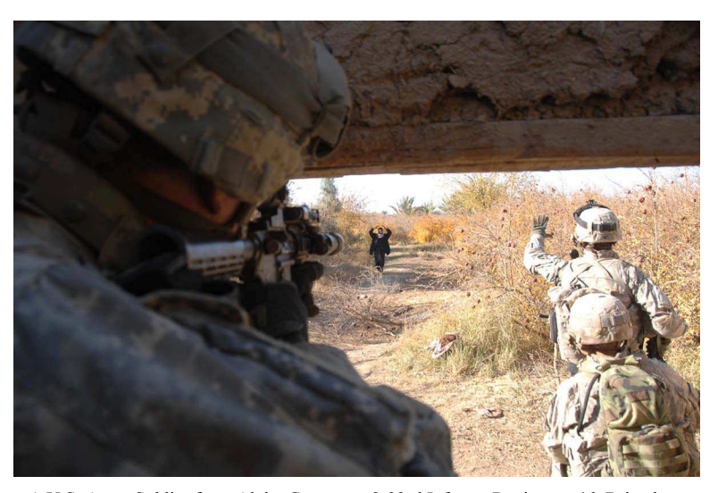
A U.S. Army Soldier from Alpha Company, 2-23rd Infantry Regiment, 4th Brigade Combat Team, 2nd Infantry Division, keeps his weapon aimed while his partner confronts a local man with a weapon approaching them from the vine groves in west Muqdadiyah, Iraq, Dec. 12, 2007.

Coalition forces continued operations against AQI north of Muqdadiyah in the new year. On January 2<sup>nd</sup> Coalition forces detained four individuals associated with the network north of Muqdadiyah. On January 3<sup>rd</sup> an AQI safe house in Muqdadiyah was targeted in the morning and then another terrorist group operating in the region was engaged in the afternoon. In these two operations 7 terrorists were killed. The next day, on January 4<sup>th</sup>, Coalition forces conducted two coordinated operations north of Muqdadiyah targeting individuals associated with "the leader allegedly responsible for directing a large terrorist group that conducts executions in the region." Intelligence reports indicated that this group had executed two individuals in the previous few days and was the same group involved in firefights with Coalition forces in the preceding weeks. In the two separate operations Coalition forces killed 2 terrorists, detained 2 others and destroyed an AQI safe house. <sup>23</sup>