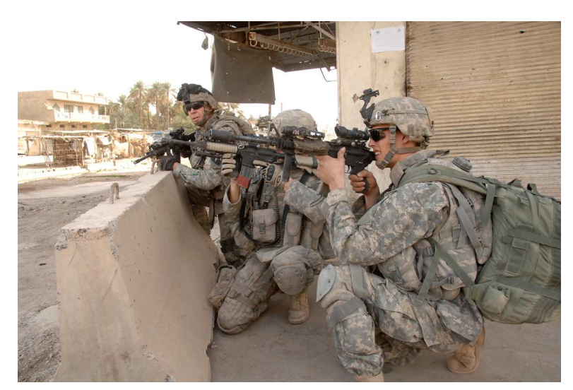
Soldiers from Alpha Company, 2-23 Infantry Regiment, 4th Brigade Combat Team, 2nd Infantry Division take cover behind a barrier while looking for the direction of fire they received, in West Muqdadiyah, Iraq.

During these four days of operations Coalition forces also discovered nine weapons caches containing "anti-aircraft weapons, sniper rifles, more than 65 machine guns and pistols, 50 grenades, a surface-to-air missile launcher and platform, 98 personnel mines, 170 pipe bombs, 130 pounds of homemade explosives, 21 rocket propelled grenades, numerous mortar tubes and rounds." These weapons were destroyed to prevent their future use by enemy forces.