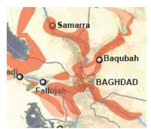
Map 2: Areas of AQI Control in the Baghdad Belts in December, 2006.

AQI not only used the belts to project force into Baghdad, but also south of the capital into northern areas in Babil and Wasit provinces. This system allowed AQI to maintain a steady tempo of spectacular VBIED attacks throughout central Iraq.