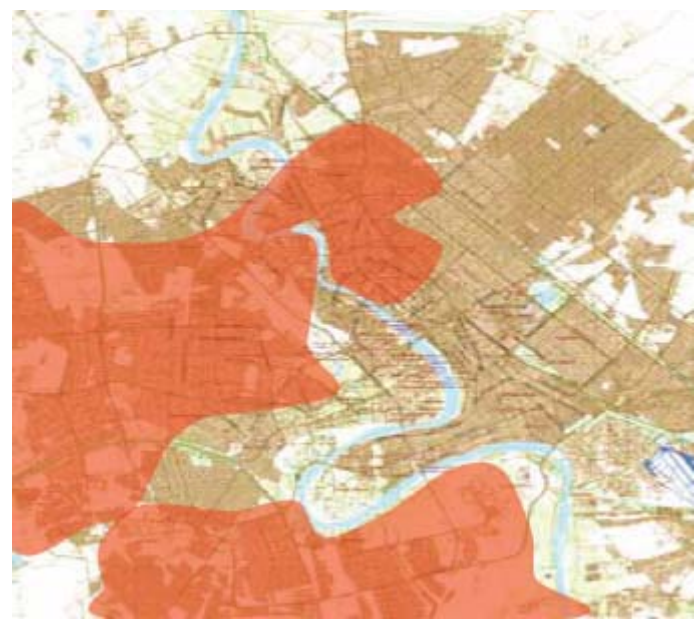
Map 1: Areas of AQI Control in Baghdad in December, 2006

relied on cells that were specifically tasked with helping to take those VBIEDs that were constructed in the belts and detonate them in strategic locations around the city.